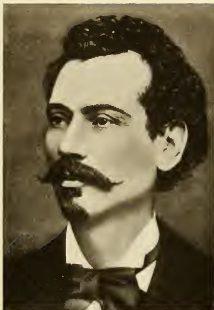
PEREZ BEN MOSHEH SMOLENSKIN